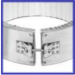
Standard Built-In Bracket

Limitations: Min ID: 2" (50.8 mm) Min. Width: 1" (25.4 mm)