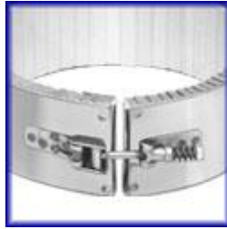
Latch & Trunion

Limitations: Min ID: 4" (101.6 mm) Min. Width: 1" (25.4 mm)